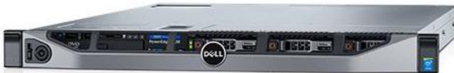
Figure 2-1: Dell PowerEdge R630 server.